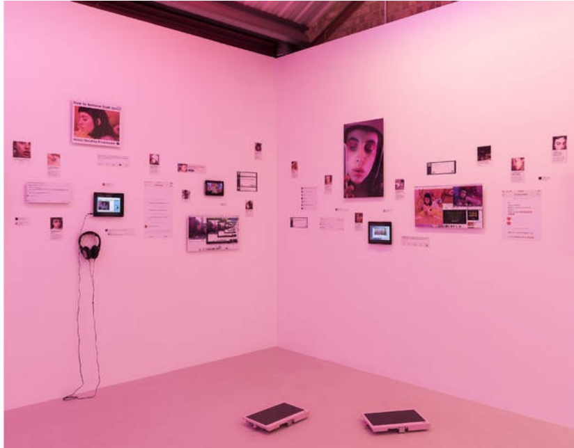
Installation view, 'Molly Soda: From My Bedroom To Yours', 2016.