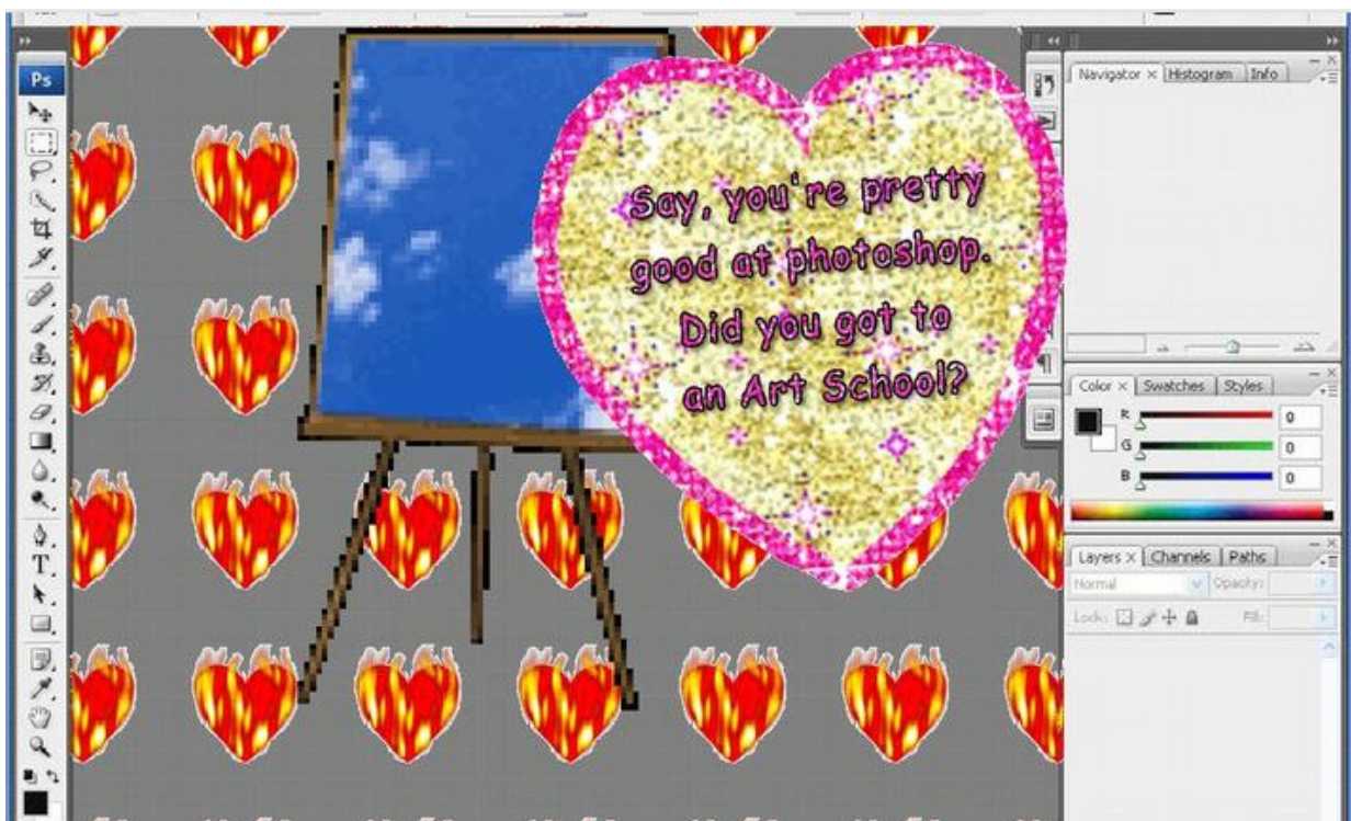
Screenshot, Art School ( http://newhive.com/mollysoda/artschool ).

Perfect for your honey or hate-crush, we recommend you check out her 25 valentines published on NewHive ( http://newhive.com/mollysoda/profile ).