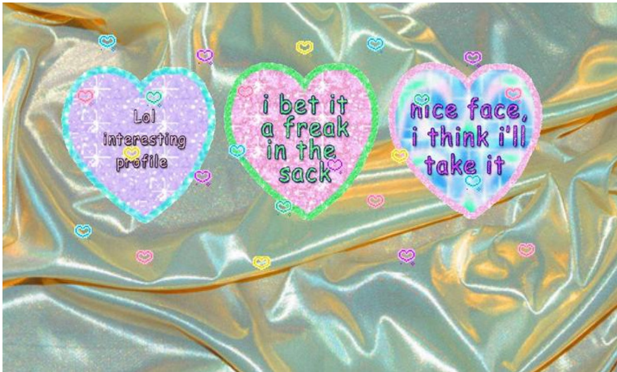
Screenshot, Nice Face ( http://newhive.com/mollysoda/niceface?q=%40mollysoda%20%23gif ).

I decided to use NewHive because I like how much easier it makes everything. It's a more intuitive way to work with web design and a really nice way to share things. It's a new concept, I've always liked the idea of making websites that stand alone as "pieces" that don't necessarily need to "function" a certain way, and NewHive totally facilitates that for me.