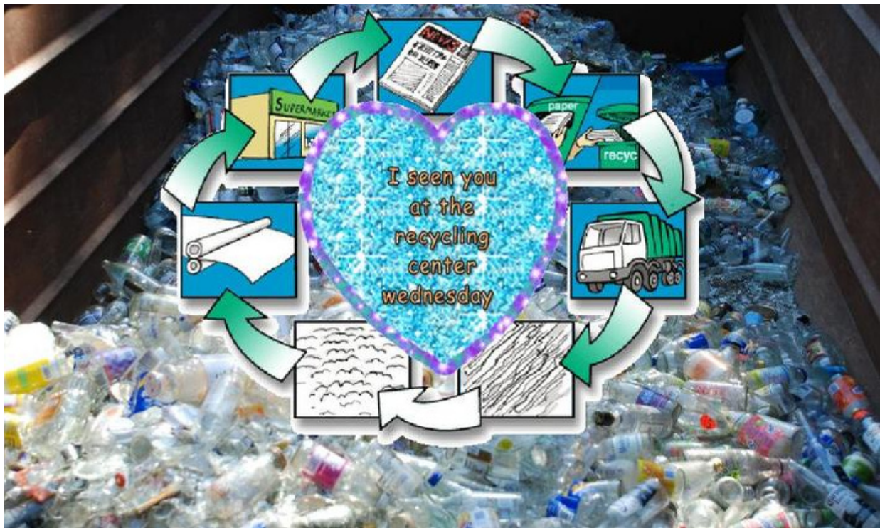
Screenshot, Recycle ( http://newhive.com/mollysoda/recycle ).

"Car"- I would definitely want to date a guy that drives a car. It's important if you live in Detroit, and I want someone to drive me to Home Depot and stuff.