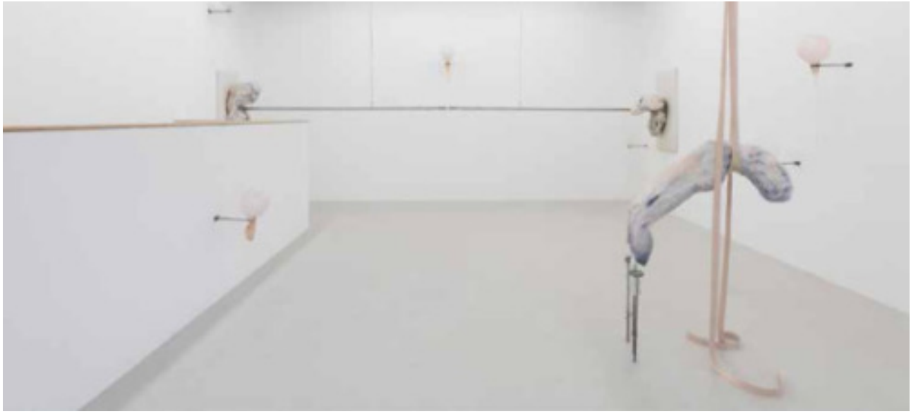
Ivana Basic, Throat Wanders Down a Blade Installation shot, 2016. Mixed materials; dimensions variable. © Annka Kultys. Courtesy the artist and Annka Kultys Gallery.

Ivana Basic's first UK solo exhibition, 'Throat Wanders Down a Blade', is currently on show at Annka Kultys Gallery, London. Using written narrative and drawings alongside sculpture; Basic both navigates and interrogates the psychic and physical materiality of human existence. She discusses the uncontrolled body, societal constructs of identity and the further concepts which drive her practice with Charlotte Barnard for Traction .