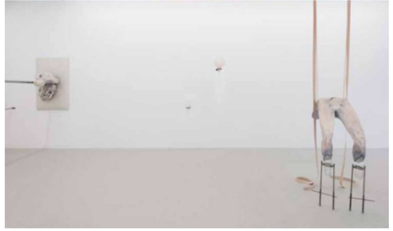
Ivana Basic, Throat Wanders Down a Blade Installation shot, 2016. Mixed materials; dimensions variable. © Annka Kultys. Courtesy the artist and Annka Kultys Gallery.

The text is written in order to relate to the reader the experience of being contained within matter that will expire, within the limited space of the body. I feel the pieces in the show very intensely and I wanted the audience to feel them just as strongly through this text. Courtney offered the name Bridle, referring to the horse harness, as an apparatus to control, hold and constrict the life force.