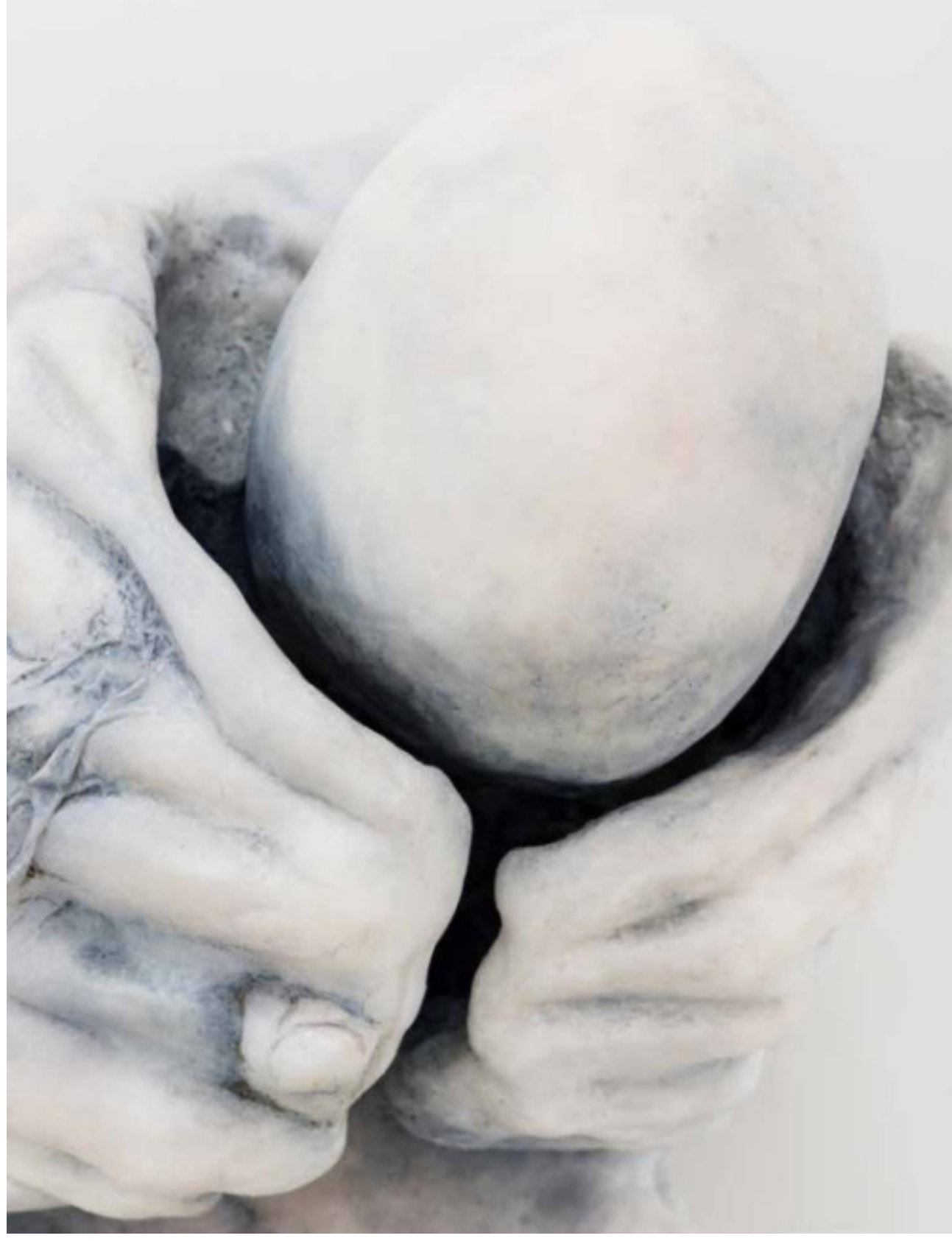
Ivana Basic, Population of Phantoms Representing Me #1 (detail), 2016. Wax, oil paint, pressure, weight, stainless steel, leather; 110 x 37 x 40 cm (43 \frac{1}{2} x 14 \frac{1}{2} x 15 \frac{3}{4} in). © Annka Kultys. Courtesy the artist and Annka Kultys Gallery.