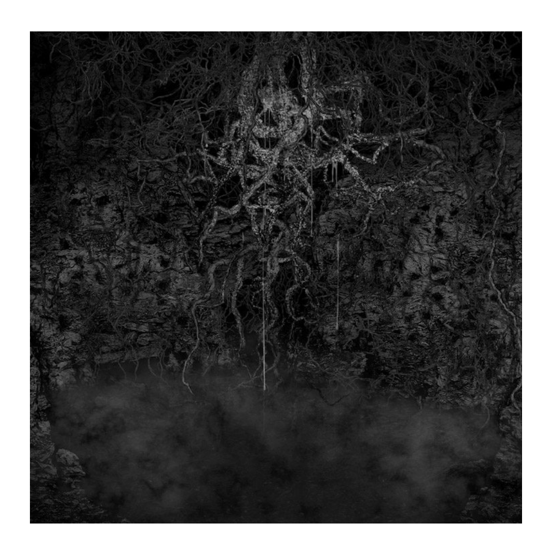
IC98: Meditations on the Anthropocene @ Beaconsfield Projects

Step into darkness for two supremely atmospheric films. Both are projected into cavernous spaces, one where we stand at the top of steps and watch souls get sucked into a giant cloud. In the other a giant space feels claustrophobic as roots grow on screen and sound reverberates us — we felt like people could appear from the darkness around us. A fantastic first visit for us to this gallery in Vauxhall. Until 23 April.