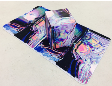
ANNE VIEUX infinity cube 2017 Lenticular print, wood and printed rug 40 × 148 × 89 cm (15 3/4 × 58 1/4 × 35 in) Edition of 2 (AVie007.17)