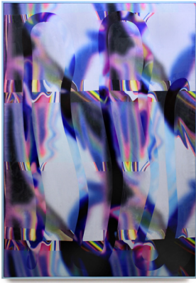
ANNE VIEUX woven web 2017 Acrylic on sublimation dyed faux suede, traces and frame 183 × 127 cm (72 × 50 in) Unique (AVie005.17)