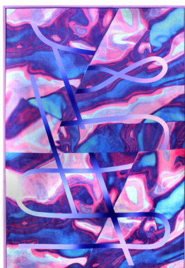
ANNE VIEUX cybergrape 2017 Acrylic on sublimation dyed faux suede, traces and frame 132 × 89 cm (52 × 35 in) Unique (AVie003.17)