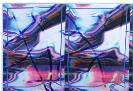
ANNE VIEUX //wavelength (double vision series) 2017 Acrylic on sublimation dyed faux suede, traces and frame 89 × 132 cm (35 × 52 in) Unique (AVie002.17)