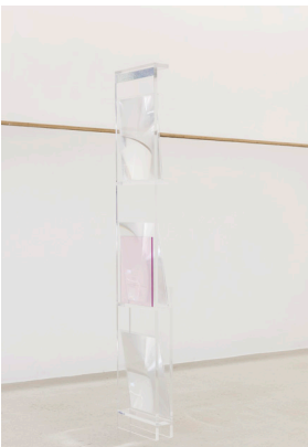
ANNE VIEUX spacer 2017 Acrylic, lenticular lens and holographic foil 123 × 24 × 7.5 cm (48 3/4 × 9 1/2 × 3 in) Unique (AVie008.17)